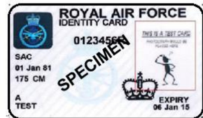
Royal Air Force

Spouses of serving personnel may also hold MOD90 ID cards, but with an endorsement of "DEPENDENT" and must not be accepted as an authority to travel.